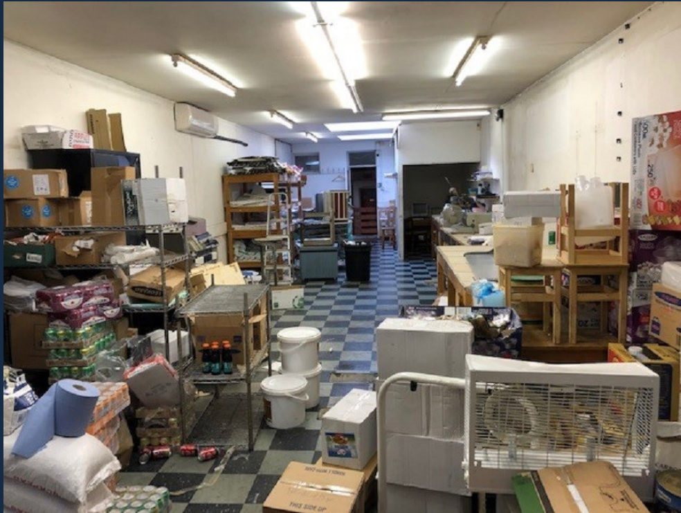
Workshop before clearance

Comprising large store/workshop at the rear of retail premises that has been used as a printers for many years. The rear store/workshop has a separate access from a passageway way at the rear of the shops leading onto Finchley Road. The shop can be rented together with the workshop or without. To the rear of the workshop there is a small yard area.