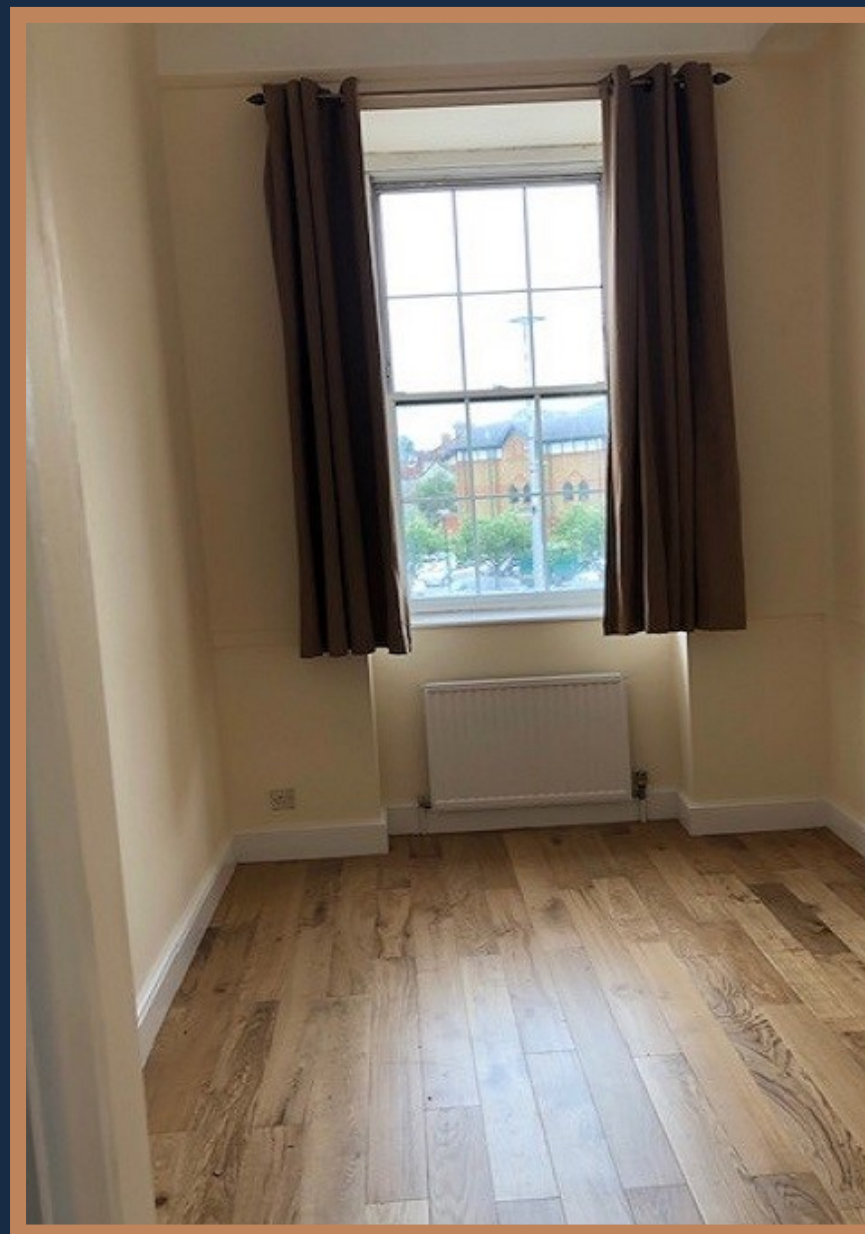
First Floor Flat