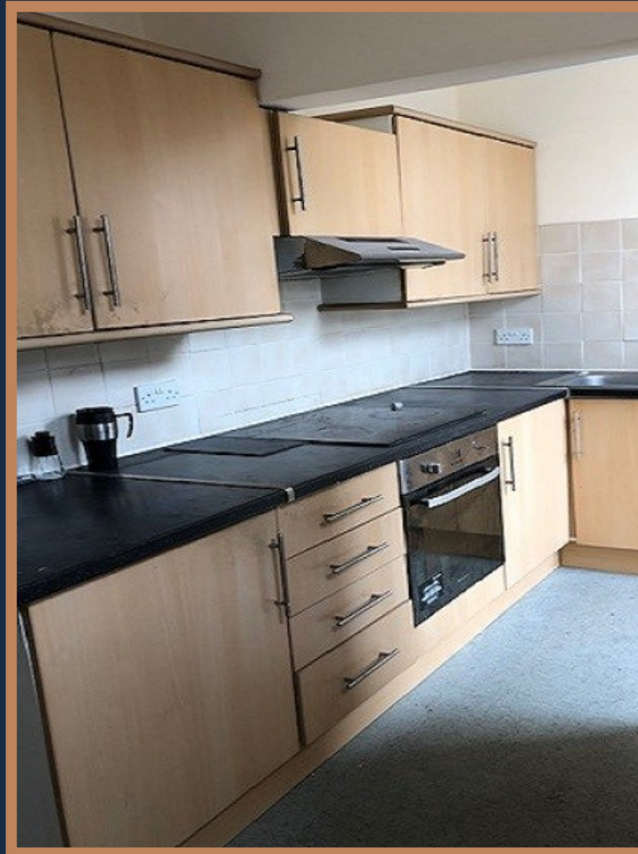
Kitchen — First Floor Flat