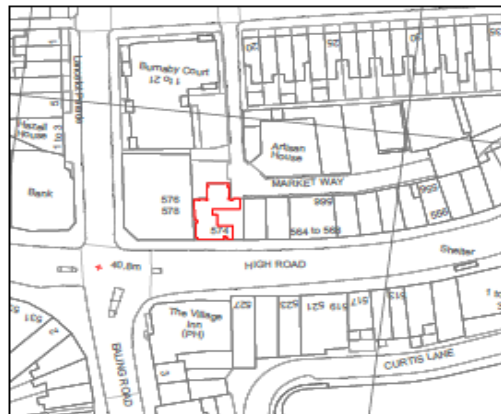
SITE PLAN SCALE 1:1250@A3