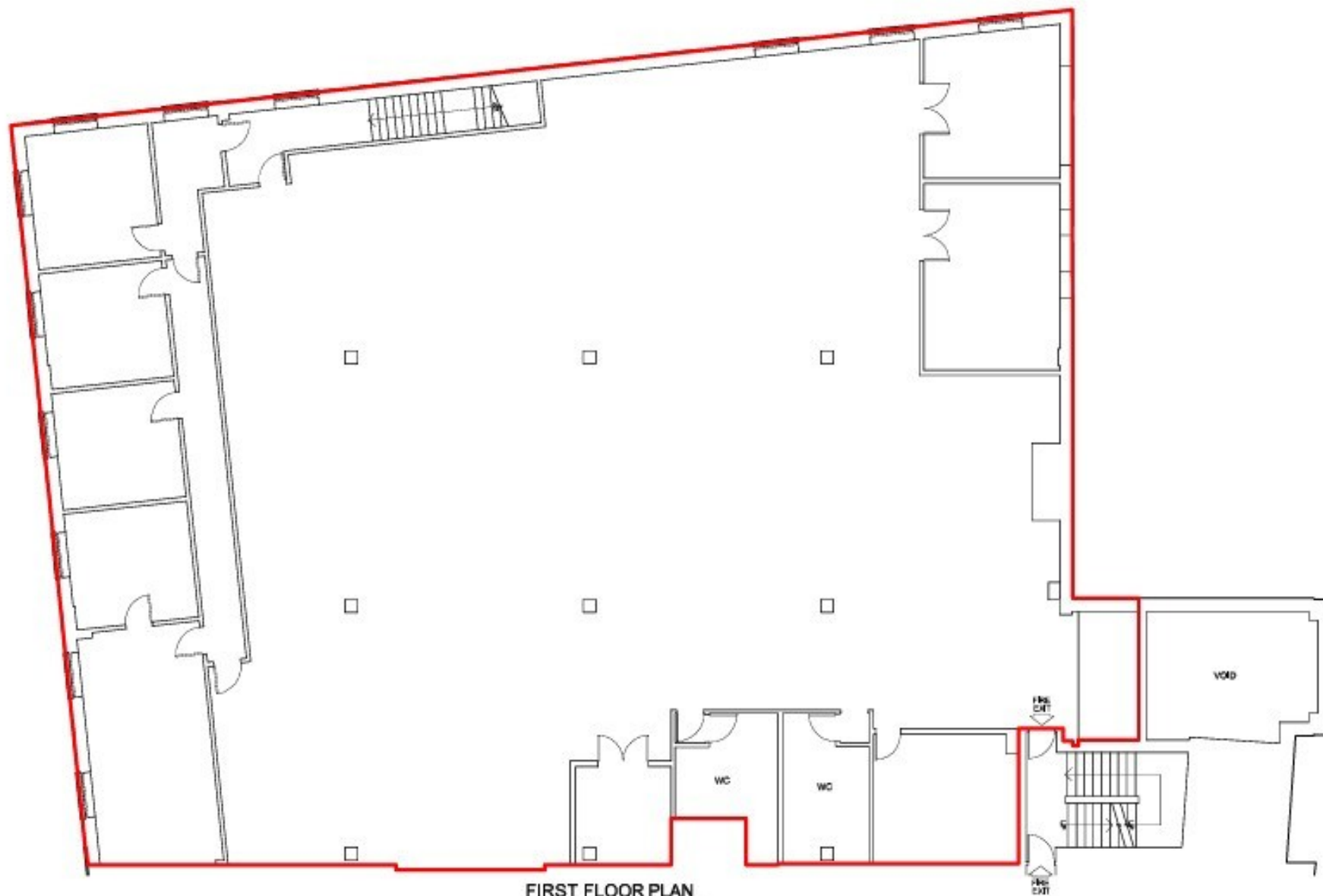
FIRST FLOOR PLAN GROSS INTERNAL AREA - 718 MSq / 7729 FtSq